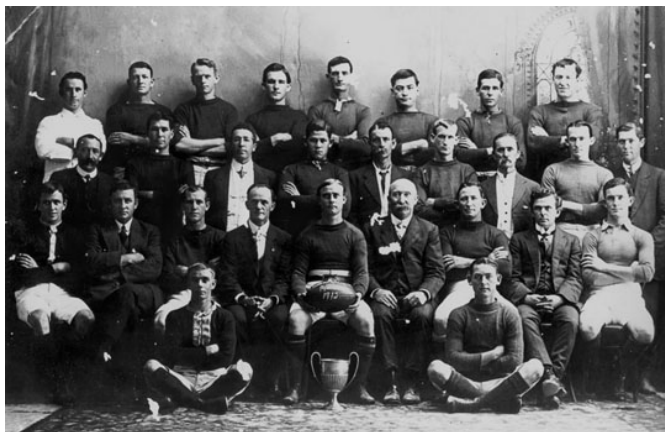
The latest additions to the Genealogy Search Engine include significant new photo archives.